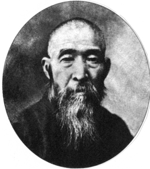
Sun Lu T’ang (1859-1932)